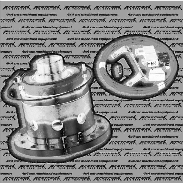
XL-7 Rear locker 1.png